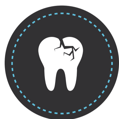
A broken tooth